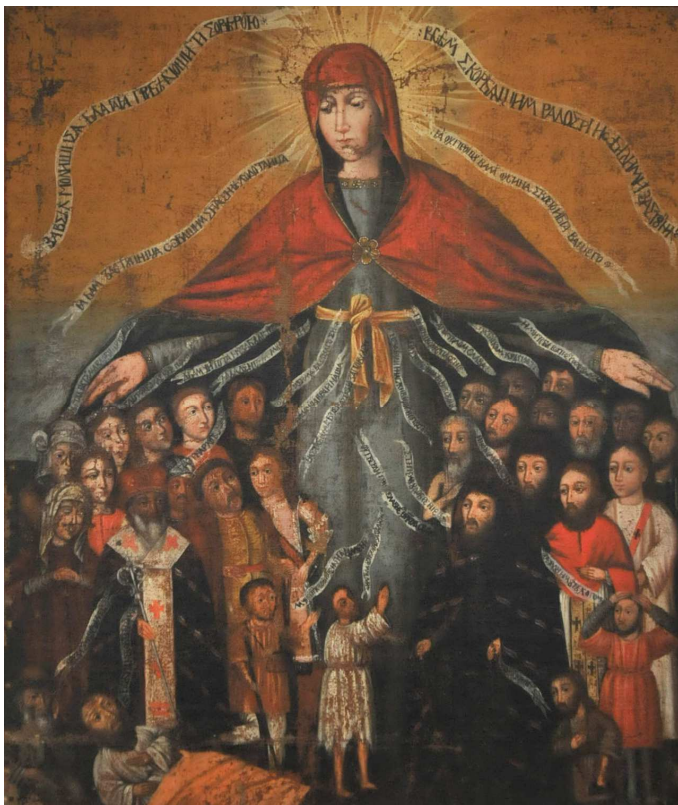
October 1 is the holyday of the Protection of the Mother of God